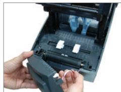
Auto-Cutter : Easy installation